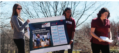
CRS Migration Walk in solidarity with refugees and those displaced by crime, conflict and natural disasters.

The CRS Social Justice Ambassadors at Assumption organize and lead campus campaigns to raise awareness and foster dialogue on issues of global inequality, justice, and solidarity among students, faculty and staff of the College.